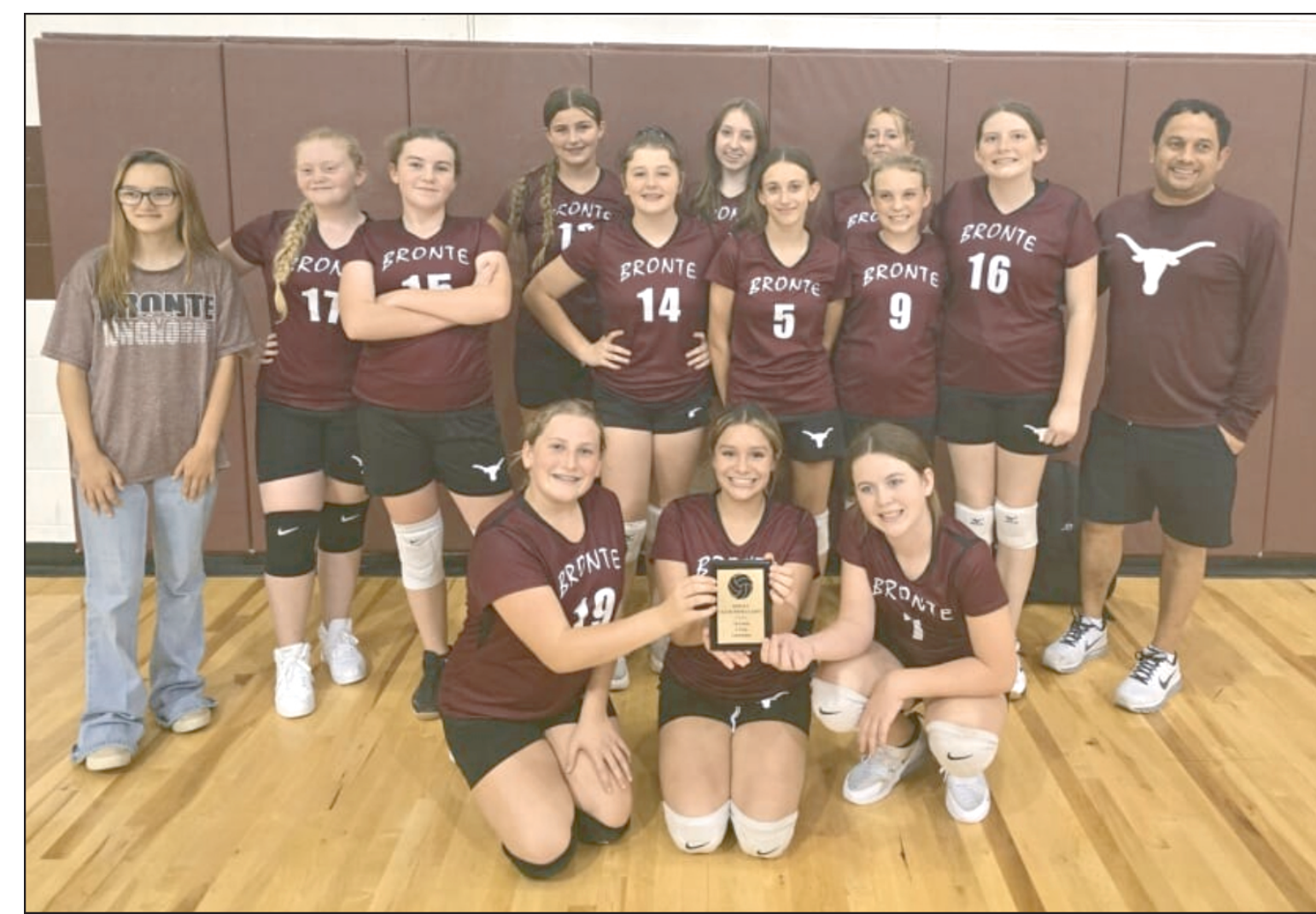
Volleyball! The Bronte Junior High School Lady Shorthorns volleyball team won the consolation bracket at the Hawley tournament on Saturday, September 21.

Chicken nuggets, mac-ncheese, carrot sticks, cucumber slices, strawberries and bananas,