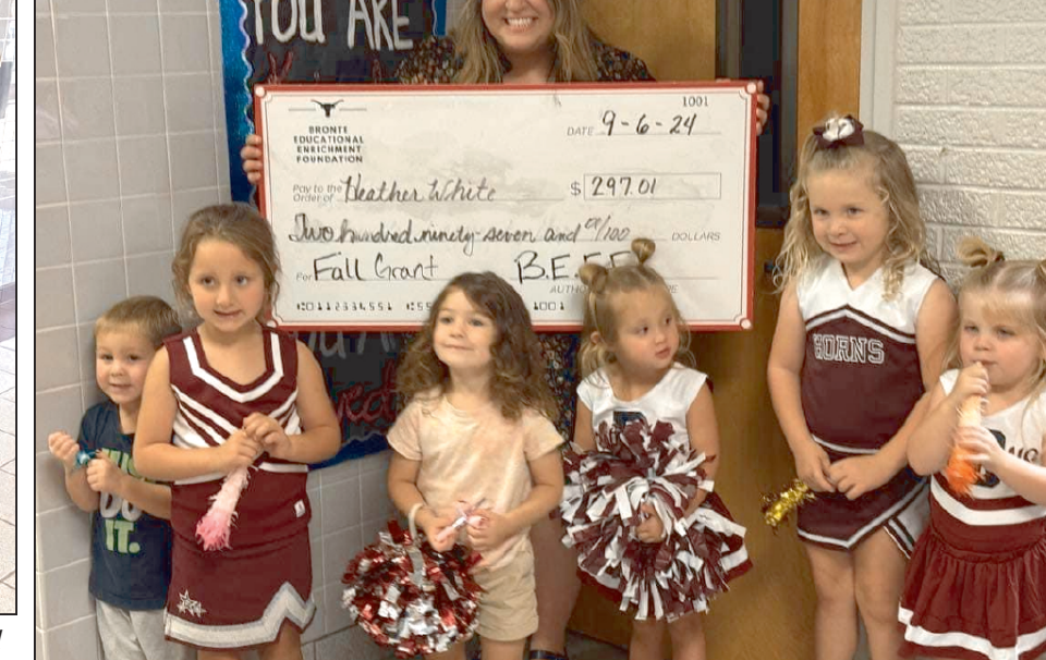
Grants! The Bronte Educational Enrichment Foundation (BEEF) grant patrol visited Bronte ISD on Friday, September 6. Over $1100 was awarded to six very deserving educators. Grant money this semester will go towards purchasing classroom

headphones, sensory items for special education, comfortable library seating for reading, a wireless printer for junior high and high school UIL students, and much more.