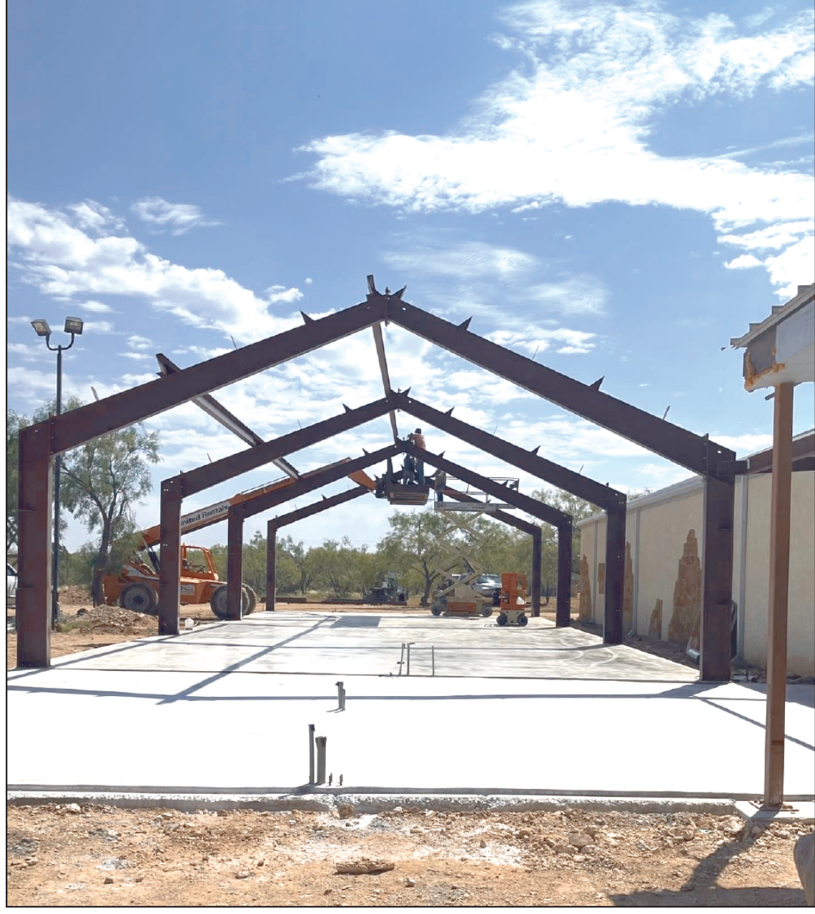
Construction Zone! Work continues on the new exhibit space and theater at Fort Chadbourne.

For more information, including eligibility requirements and acceptable documents, visit the Texas Parklands Passport page on the Texas Parks and Wildlife Department website.