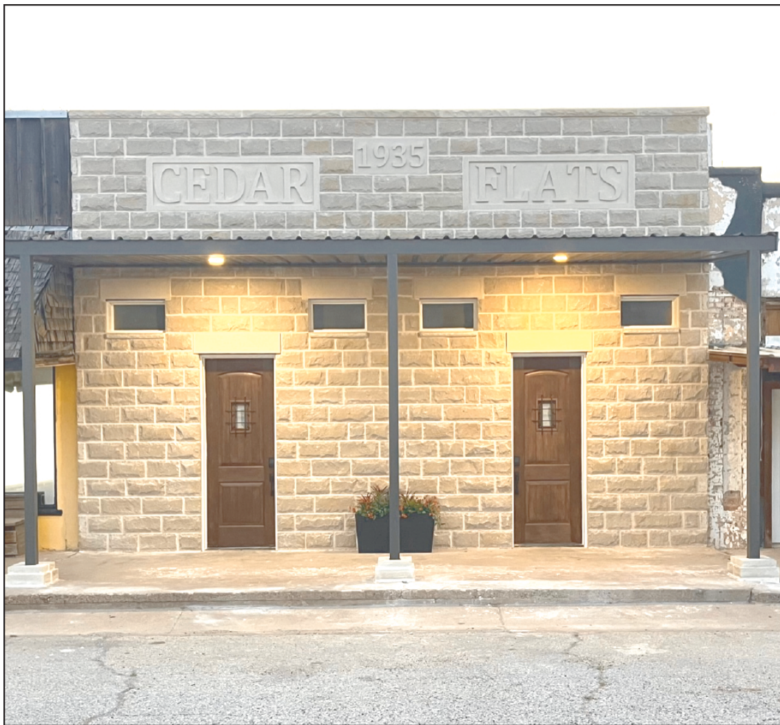
Downtown! Robert Lee is also seeing some changes being made to their downtown area. One of the historic buildings on Austin Street has been completely renovated into a beautiful new lodging establishment. The building, named Cedar Flats, has been converted into two suites and is available now for anyone needing a cozy place to stay in Robert Lee. For more information or to make a reservation, visit www.cedarflatstx.com .