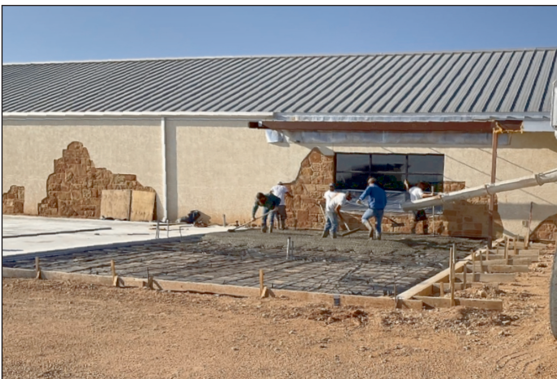
Construction! A new 3500 square foot addition to the museum at Fort Chadbourne is currently being constructed. The area will house a new exhibit area and a theater.

based on effectiveness in addressing criteria such as safety, pavement condition, capacity, and rural connectivity, with opportunities for public input at the both the state and local levels