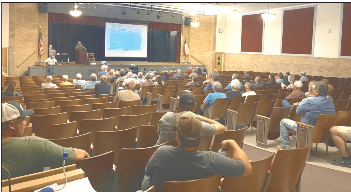
Town Hall! A Town Hall meeting was held on Monday evening, August 21, in the auditorium at Bronte ISD. The meeting was to bring awareness to the public of the desperate need for volunteers for our local EMS, particularly on the east side of the county. There was also discussion about the economic impact of creating an emergency services district.

The UTP is a planning document that guides the development of transportation projects across the state. Additionally, the UTP identifies public transportation, maritime, aviation, and rail investments. Projects are selected by TxDOT and local transportation leaders