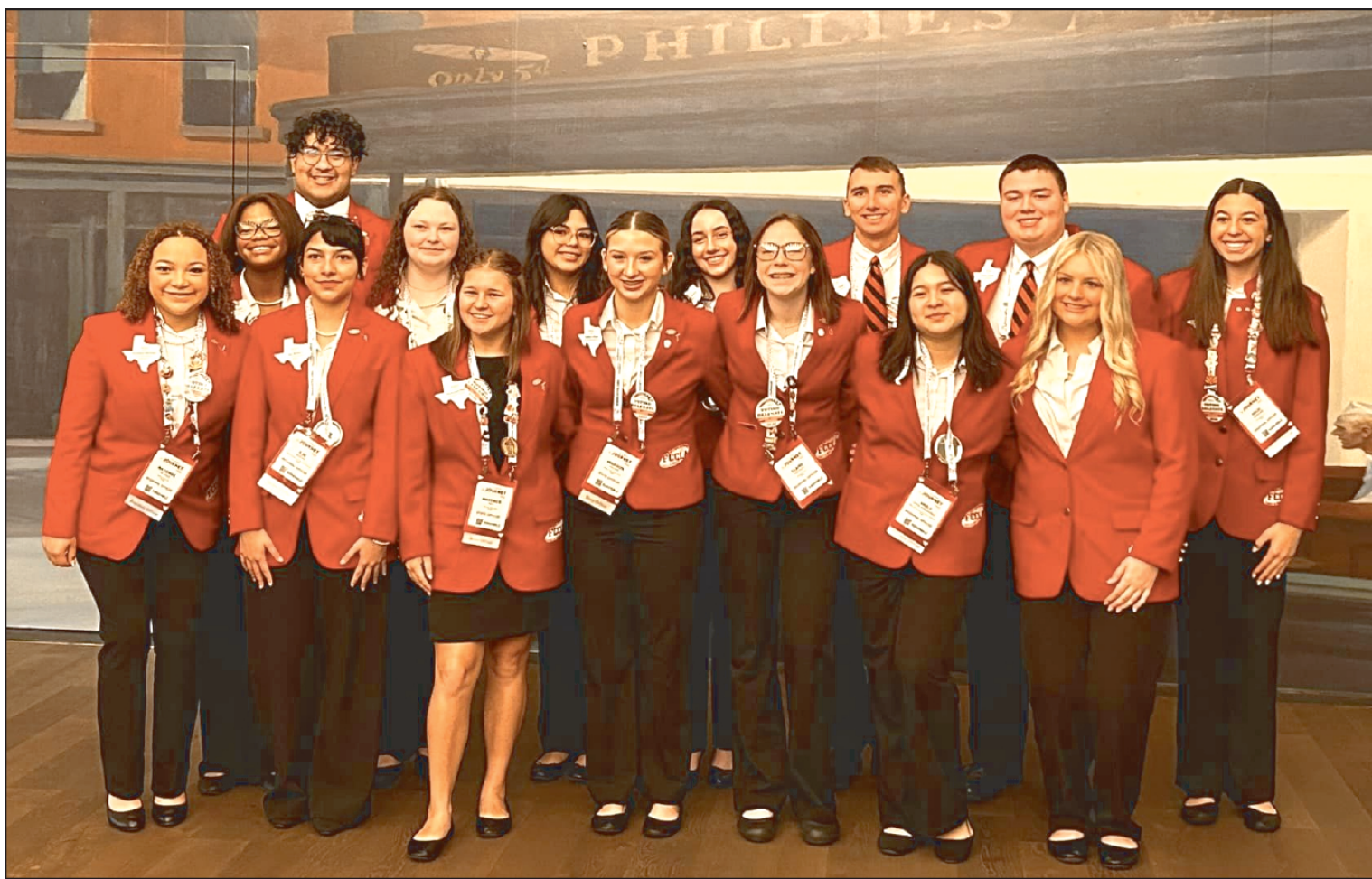
FCCLA! Robert Lee High School traveled to the Pacific Northwest earlier this week to participate in the FCCLA National Leadership Conference. In addition to competition and networking with other FCCLA groups from across the country, the students also made time to see the sights in Seattle, including the famed Public Market.