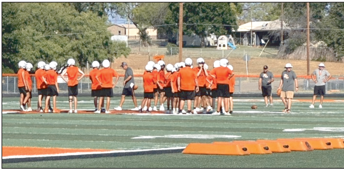
Football! The Robert Lee High School Steers kicked off their 2023 football season on Monday, July 31, with their two-a-days.

There have been 62 work orders completed, 19 poly cart work orders, five disconnects due to non-payment, three minor leaks repaired, one sewer