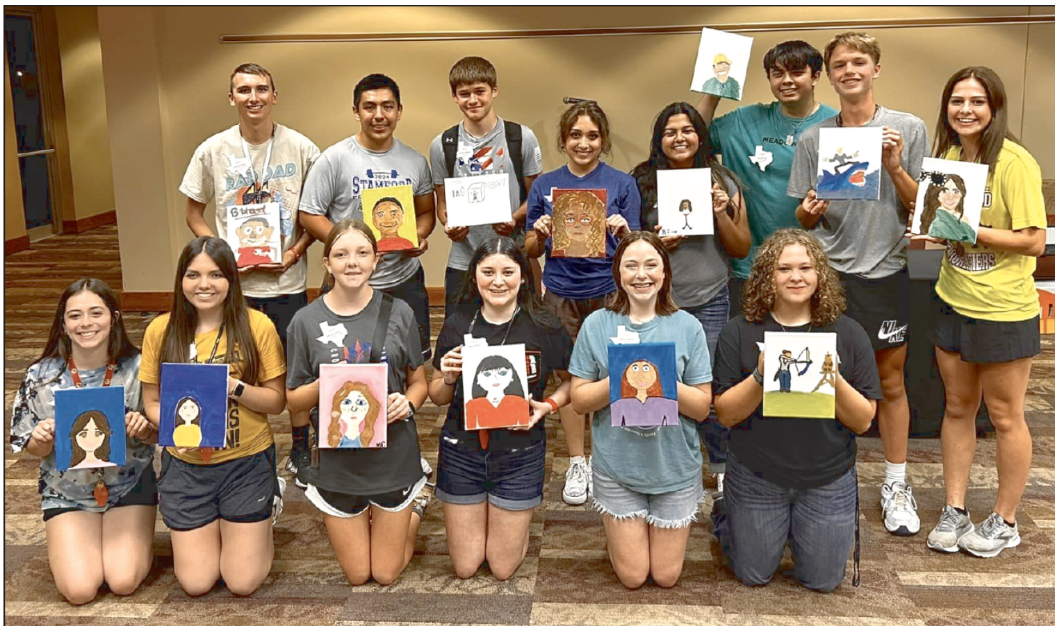
FCCLA! Robert Lee High School FCCLA recently attended training camp. During the week, plans were made for fall leadership meetings and the regional and state conferences. There was lots of work done but there was also time made for some fun as well.