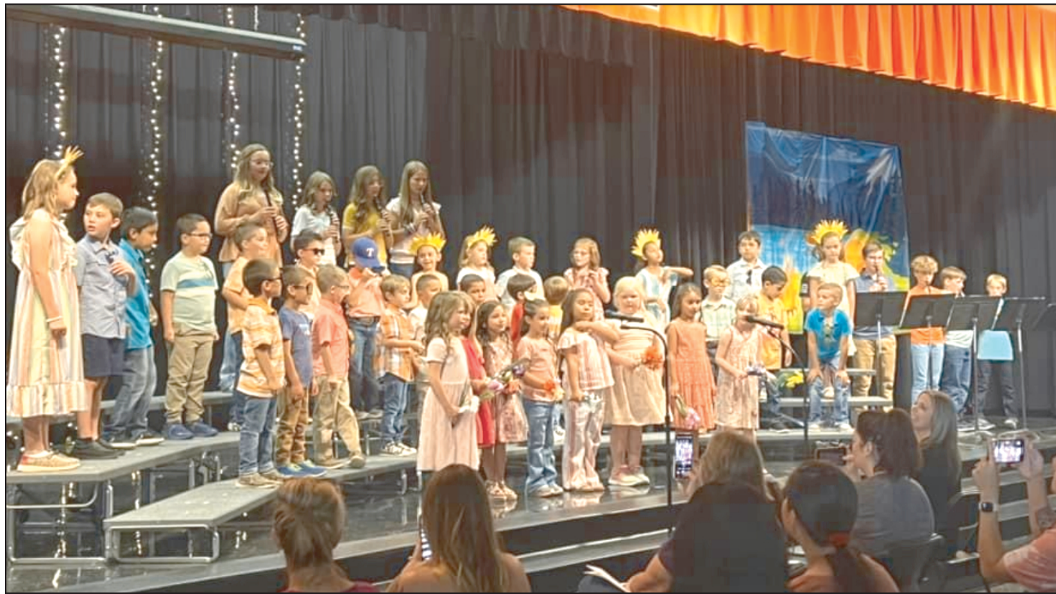
Concert! As the school year comes to a close, Robert Lee Elementary hosted their annual Spring Concert on Wednesday, May 8.