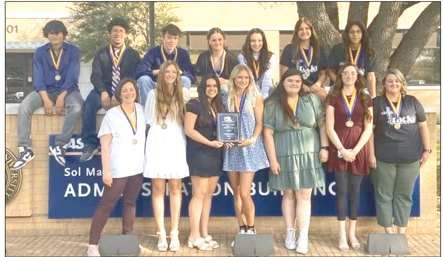
One Act Play! Bronte High School's One Act Play recently competed in the area round of competition in San Angelo and their performance earned them a trip the the regional round.

Robert Lee ISD Breakfast Monday, April 10 School Holiday Tuesday, April 11 Breakfast combo, fruit, juice, milk Wednesday, April 12 Cereal, toast, fruit, juice, milk Thursday, April 13 Breakfast pizza, fruit, juice, milk