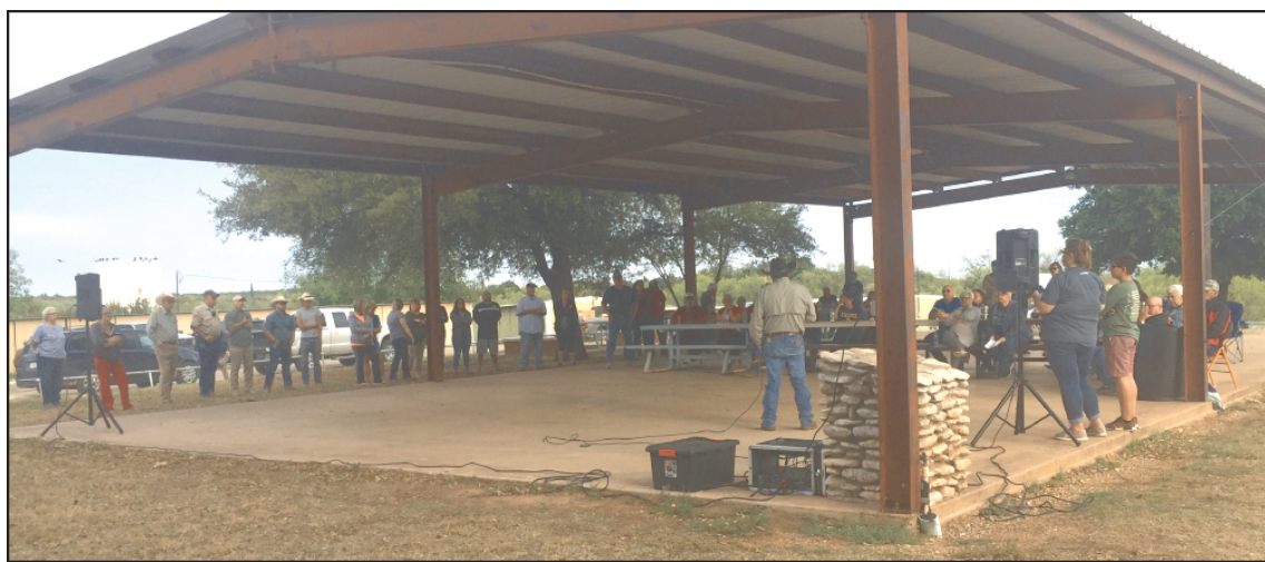
Town Hall Meeting! A large group of Robert Lee residents gathered at the Robert Lee Park Pavilion on Tuesday evening, April 16, to discuss the issues surrounding the City of Robert Lee and City Hall.