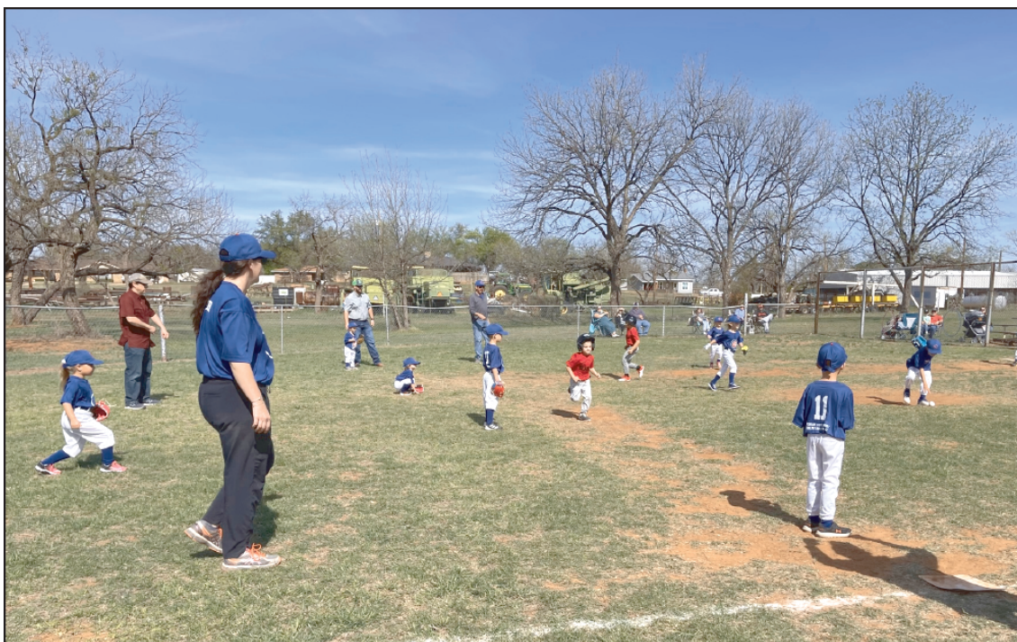
Play Ball! T-ball season in Coke County kicked off on Saturday, April 1, in Bronte. If you need a dose of cuteness, visit the ball field by the pavilion on Saturday mornings to see the action.

Massenet, came upon the ruins of the French settlement on the banks of Garcitas Creek. De León left Texas for the last time in 1690 and died in Coahuila a year later, probably around the age of fifty-two. In 1721 the Spanish built Nuestra Señora de Loreto de la Bahía Presidio on the site of Fort St. Louis.