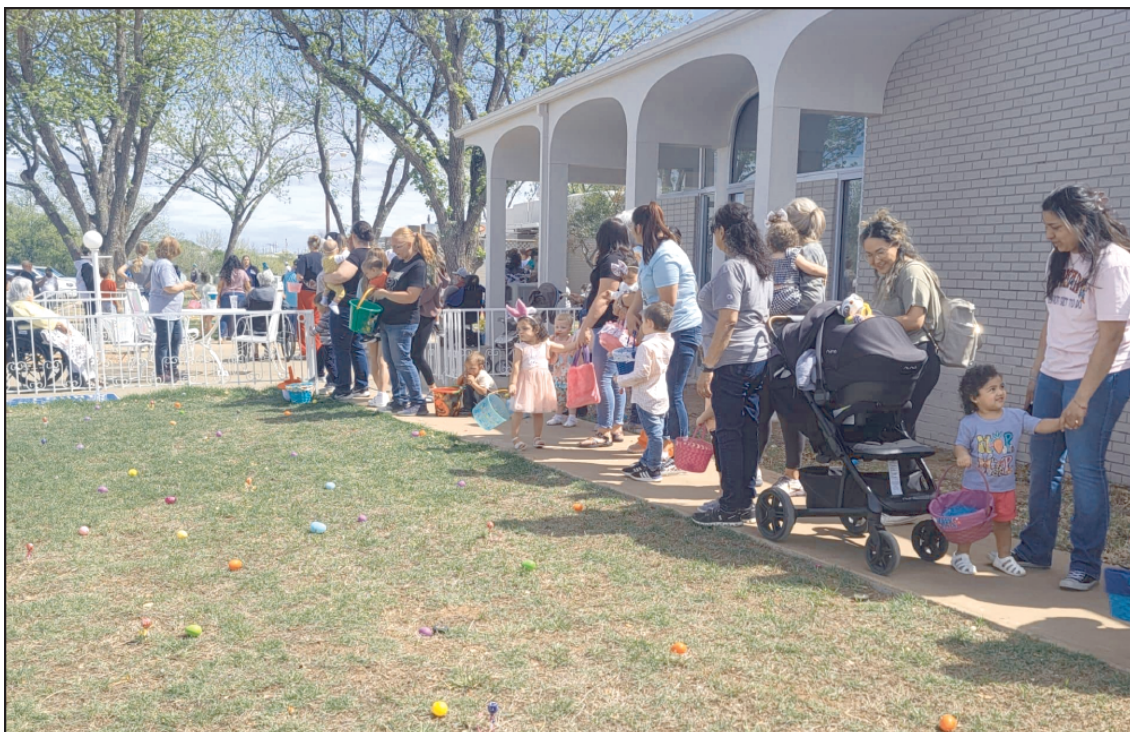
Egg Hunt! Robert Lee Care Center hosted an Easter Egg Hunt for the children of Coke County. The residents enjoyed watching the kids hunt eggs and the families had a good time visiting with the residents.

On this day in 1689, Alonso De León, Spanish governor of Coahuila, discovered and named the Guadalupe River at the approximate future site of Victoria, while leading his fourth and final expedition to find and destroy the French settlement at Fort St. Louis. De León, an early advocate of establishing missions along the Texas frontier, blazed much of the Old San Antonio Road in the course of his expeditions. Eight days after discovering the Guadalupe, he and his party of 114 men, which included Damián de