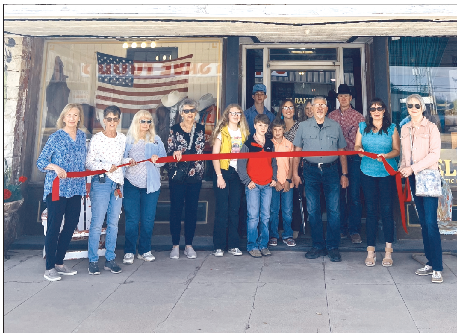
Grand Opening! A ribbon cutting and grand opening ceremony was held on Saturday morning, April 6, to celebrate El Rancho, a new shopping destination in downtown Bronte. The shop is home to many one of a kind furniture and household items, as well as clothing and accessories to fit that western eclectic style.

Then there's The Metropolis of the West. What an aspiration! This honestly made me emotional the first time that I read it. I felt it. I believed it. In fact, I still do! This slogan might even be inspiring another writing project. In 1910, The Metropolis of the West was an ideal but also a legitimate goal. Today, an outsized part of the West Texas population resides in Lubbock, Abilene, and Midland-Odessa and they influence culture and economy accordingly. In 1910, Stamford's population of 3,902