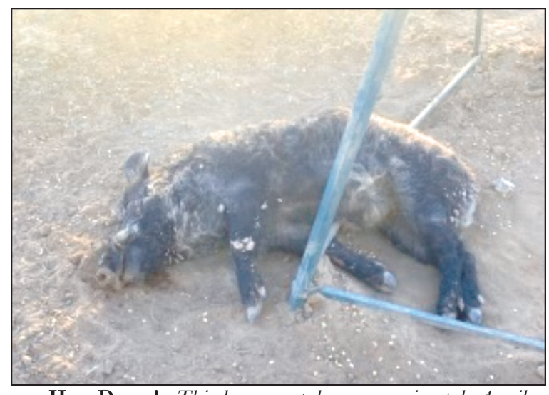
Hog Down! This hog was taken approximately 4 miles north of Bronte in mid-January 2023.

The AHP is unique because it consolidates many hunting opportunities under one umbrella. With this permit, hunters can access hundreds of thousands of acres of public lands, including Wildlife Management Areas, state forests, and leased private property. This is particularly advantageous for avid hunters, as it opens new, otherwise restricted territories, providing more flexibility and variety in hunting environments.