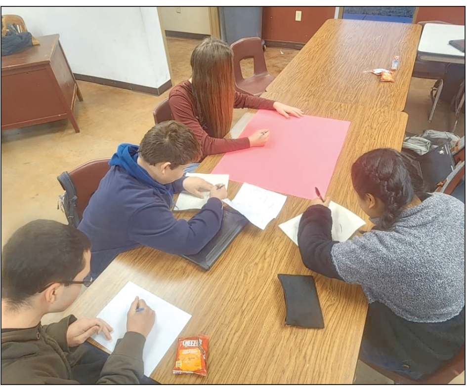
Agriculture! The Bronte ISD 8th grade Principles of Ag students recently worked on Temple Grandin inspired cattle facilities for a project (above photo). The Ag Mechanics students recently worked on fabricating gates and building a multifunction BBQ pit trailer (top right photo).