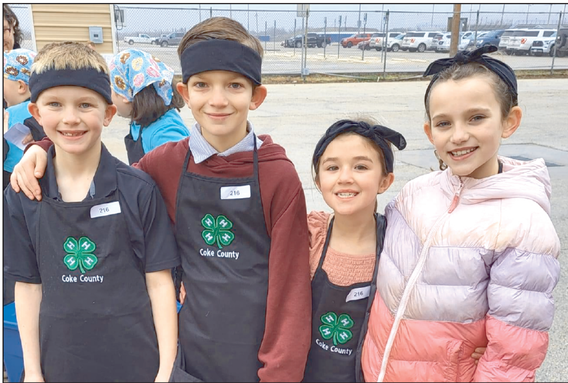
Food Challenge! The Coke County Junior Food Challenge Team competed at the District 7 Food Challenge Contest on Wednesday, January 24, in San Angelo.