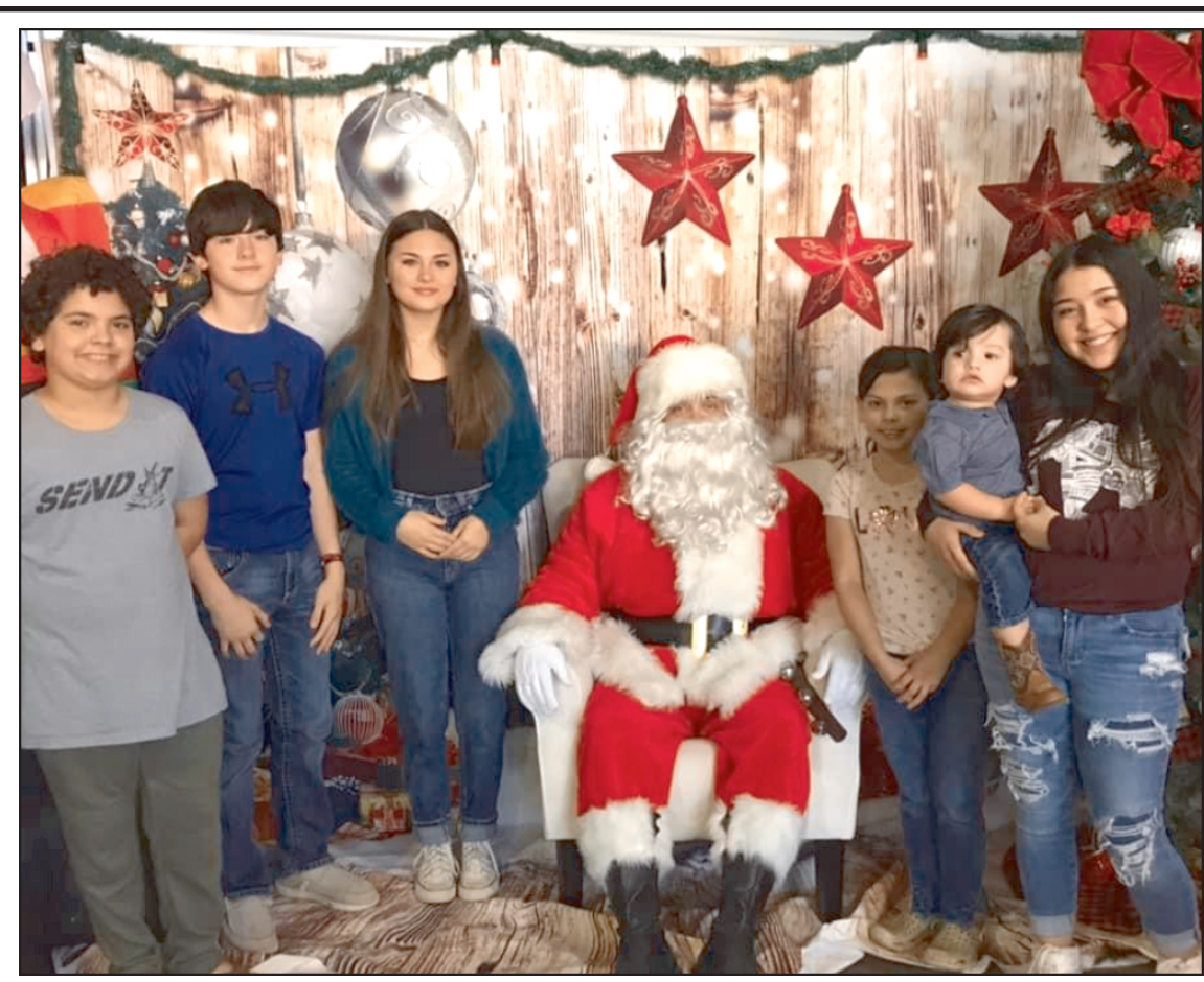
Visit with Santa! Kids of all ages stopped by to tell Santa Claus their Christmas wishes during the annual Christmas in Olde Bronte event on Saturday, December 9.