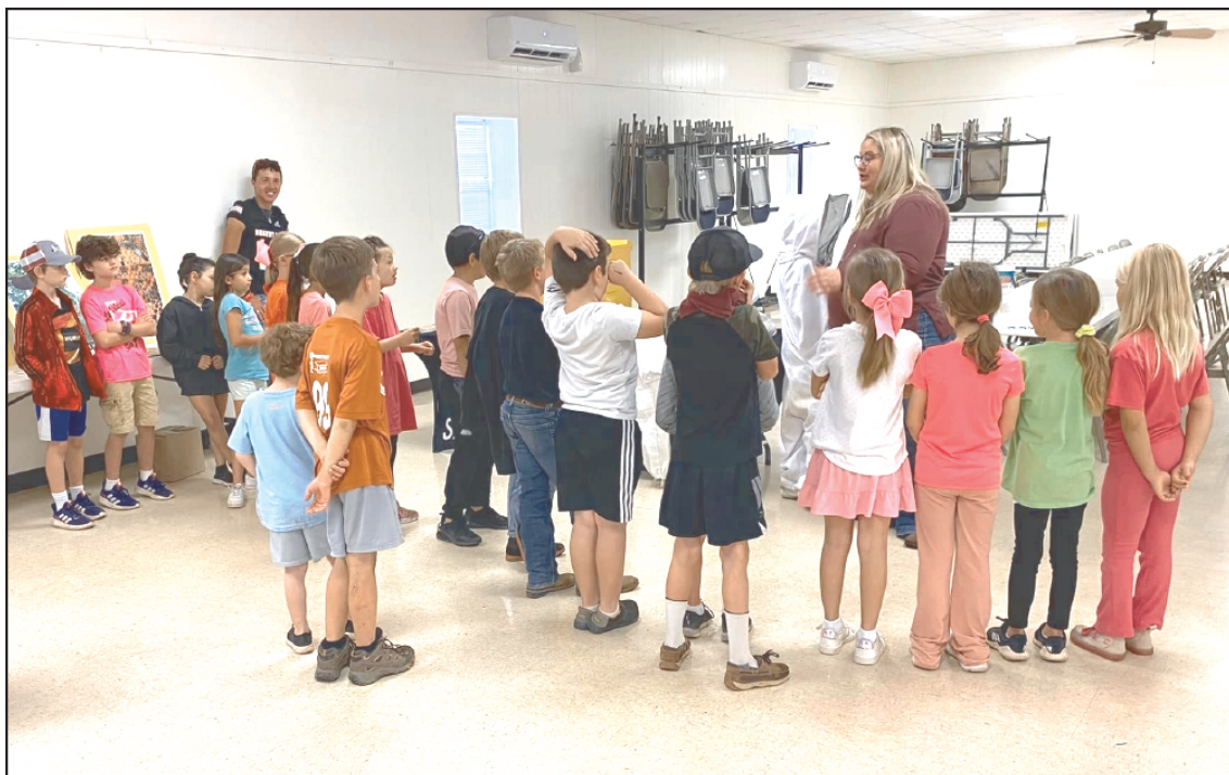
Ag Day! The Coke County Extension Office recently hosted an Ag Day at the Coke County Park in Robert Lee. The kids attending were able to participate in a variety of activities and interact with different kinds of livestock