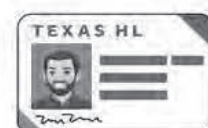
TEXAS HANDGUN LICENSE*