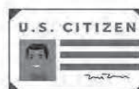
U.S. CITIZENSHIP CERTIFICATE WITH PHOTO