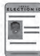
TEXAS ELECTION ID CARD*