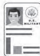
U.S. MILITARY ID CARD*