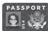
U.S. PASSPORT* (BOOK OR CARD)