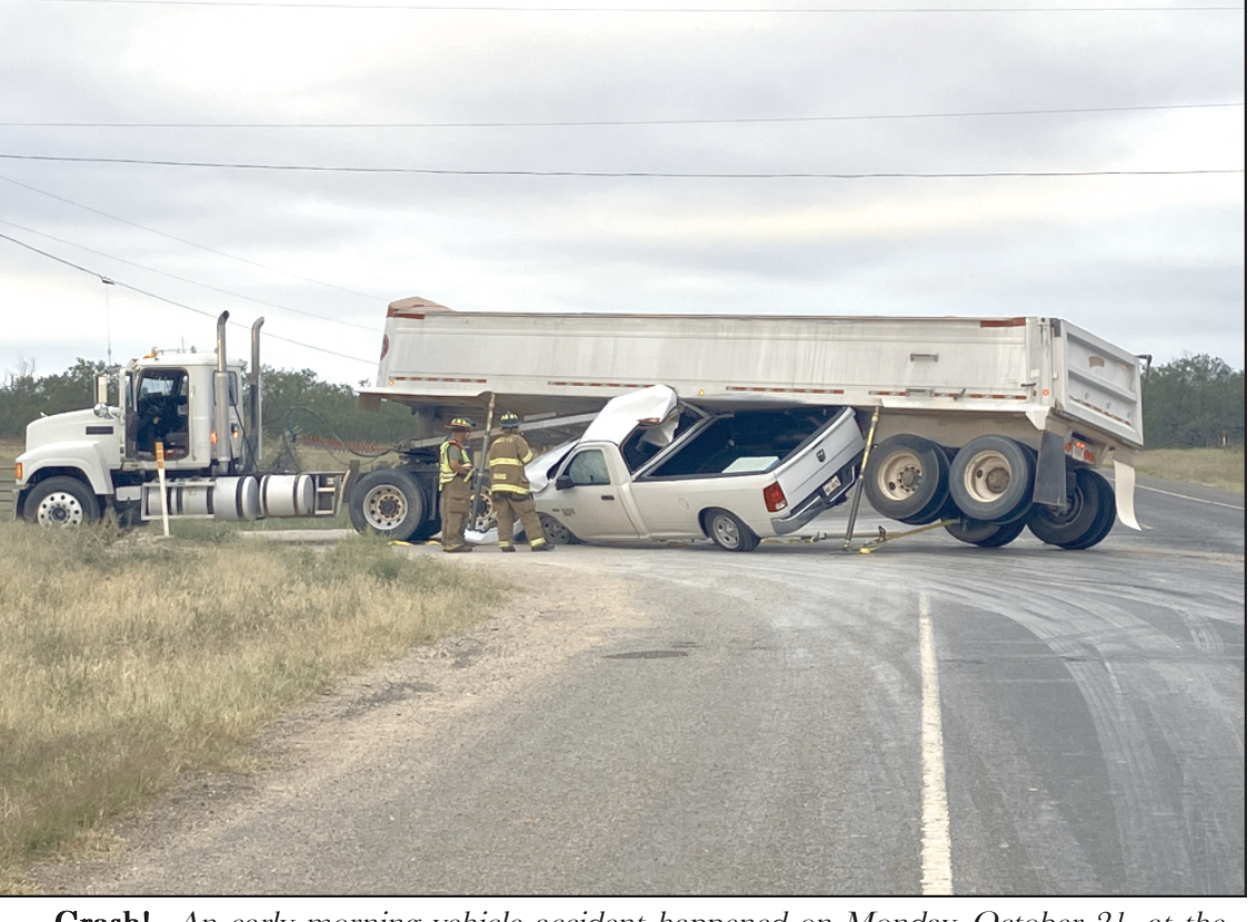
Crash! An early morning vehicle accident happened on Monday, October 21, at the intersection of State Highway 158 and Humble Road west of Bronte. The semi truck was attempting a left hand turn on to Humble Rd when the Dodge pickup tried to pass. Two people were taken to the hospital by West Coke County EMS after being extracted by Bronte Volunteer Fire Department.

With that intentional focus comes an attempt to organize my monthly writing. Roughly, each month I intend to devote one essay to agriculture and the economy, one essay to local culture, and one essay to local government. The fourth essay